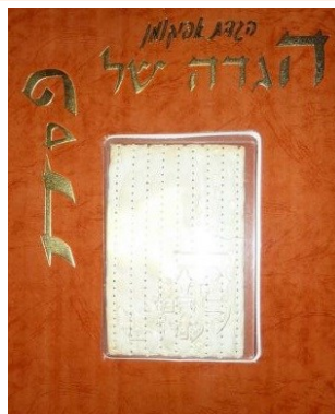
Hagadat Afikoman (Te'eneh, c.1996)