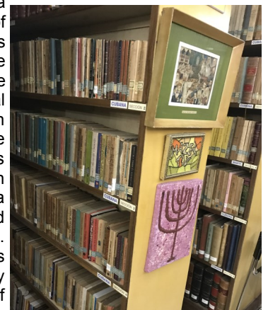
Inside the community library