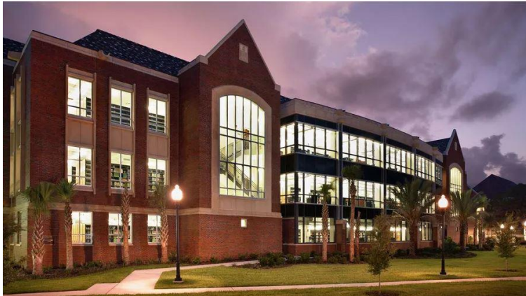
Library West facing West University Avenue, Gainesville, FL