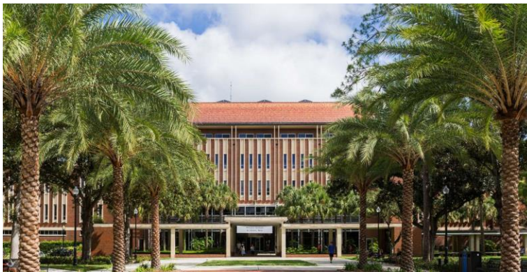
Library West facing campus