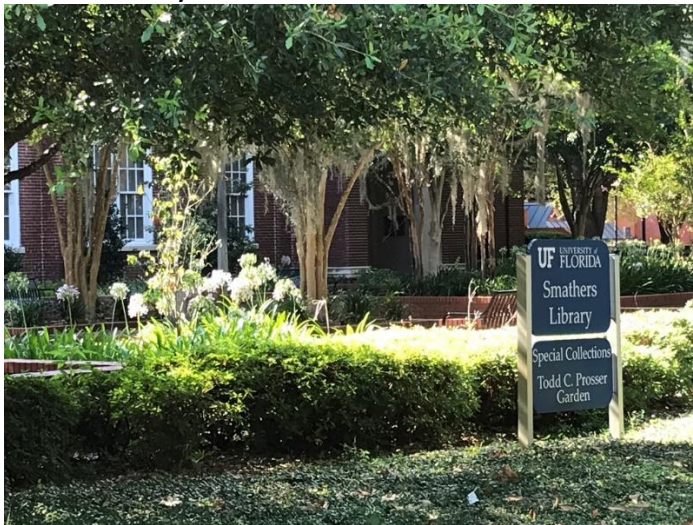
Smathers Library view from the colonnade

Smathers Library (Library East) is a one or two-minute walk along the colonnade from Library West.