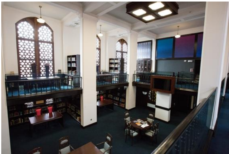
The Judaica Suite, Smathers Library (Library East)

The Price Library of Judaica is divided between two locations. The main circulating collection is in Library West on the ground floor. The special collection is housed in the Judaica Suite which is located on the second floor of Smathers Library (Library East). Library talks and tours take place in the Judaica Suite.