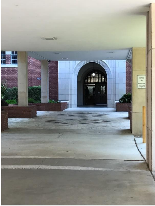
Smathers Library front entrance at the end of the colonnade